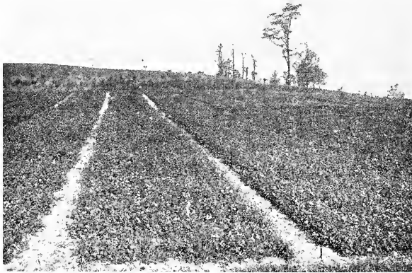
A view of the strain test with medium red clover on the Agronomy farm in 1926

In Table 1 are shown the data collected for the clover strain test at Morgantown. Average yields in tons of hay containing 15 percent moisture, average percentage of weeds in the hay, and average percentage of winter killing, together with certain other data, are presented. It will be noted from the second column of the table that all the clover strains, except the one from England, were tested during three years. The total number of plots which were employed is shown in the third column. The strain from Michigan was used as the check, which accounts for the large number of plots of this sort. Three strains of French origin were tested one year and two strains during the other two years, thus accounting for the 21 plots required for the seed from France. The number of plots of each of the other clover strains was as planned: i. e., three plots per year.